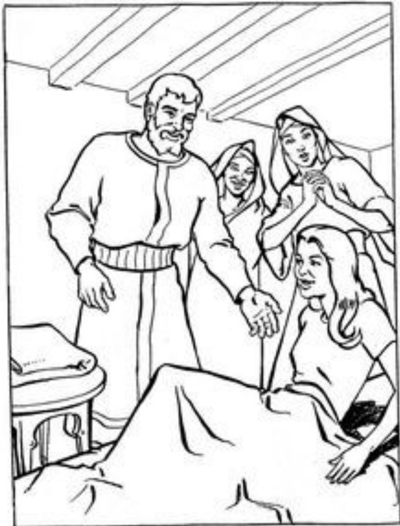
Dorcas is raised from the dead.—Acts 9:36-42